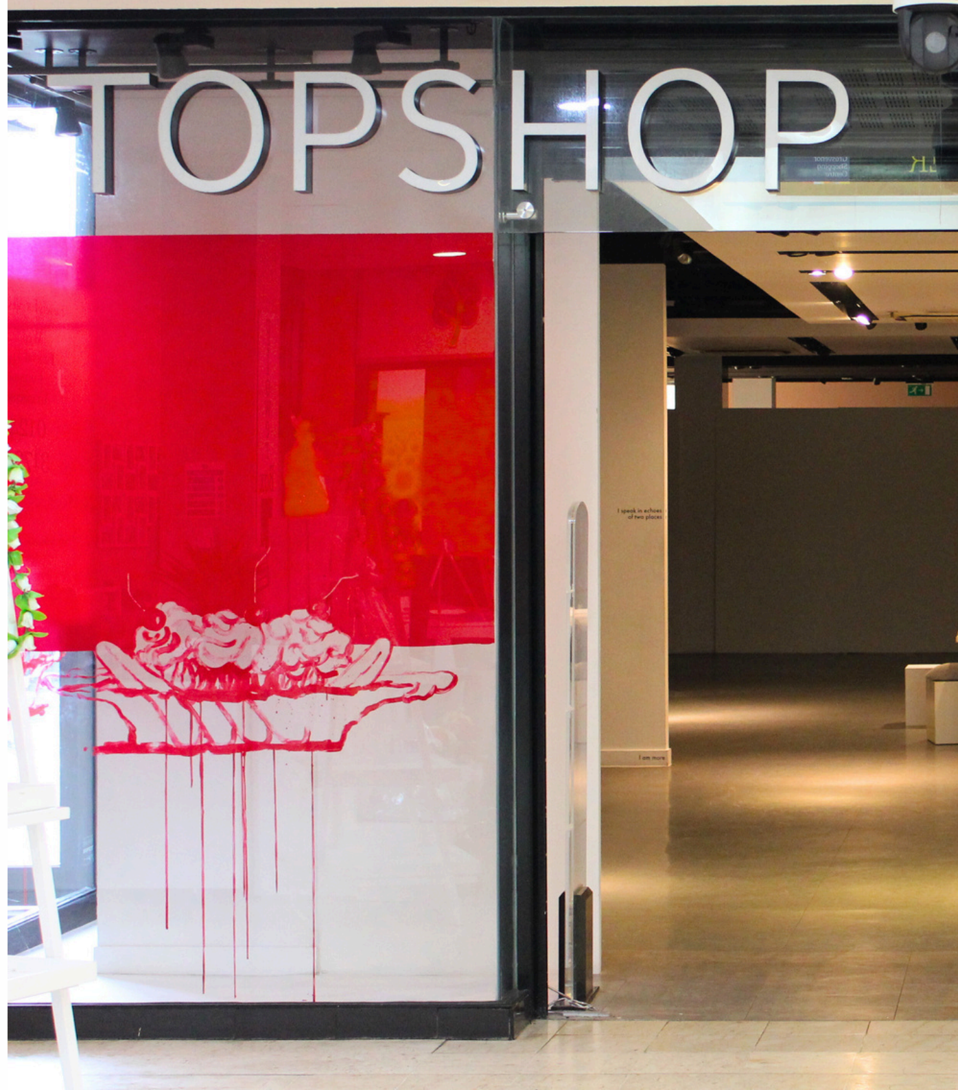
Image: Matthew Wood's Installation in the windows of New Art Spaces Chester.