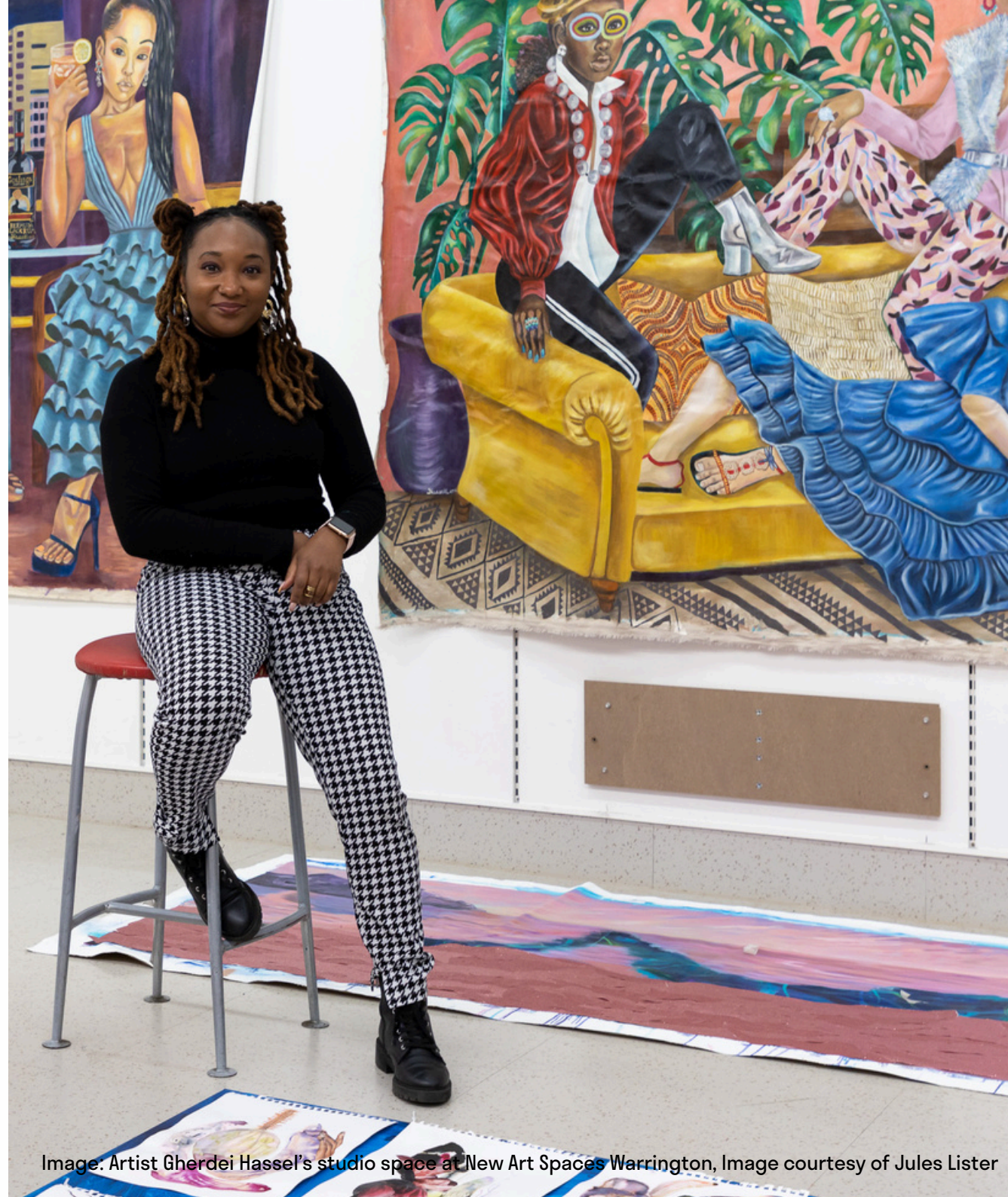
Image: Artist Gherdei Hassel's studio space at New Art Spaces Warrington

New Art Spaces are incredibly versatile and often large-scale, perfect for artists who need more open space to explore new ideas and work outside of limitations.