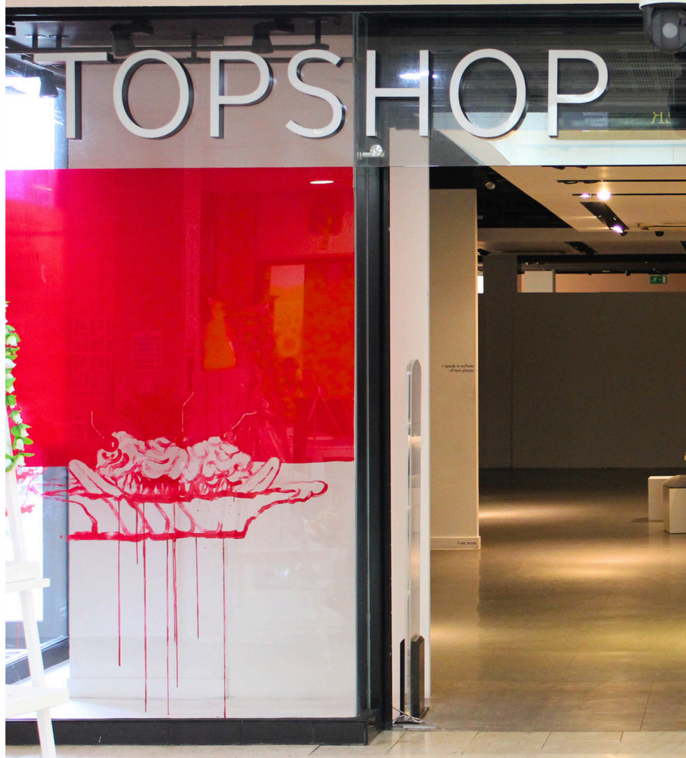
Matthew Wood's Installation in the windows of New Art Spaces Chester.