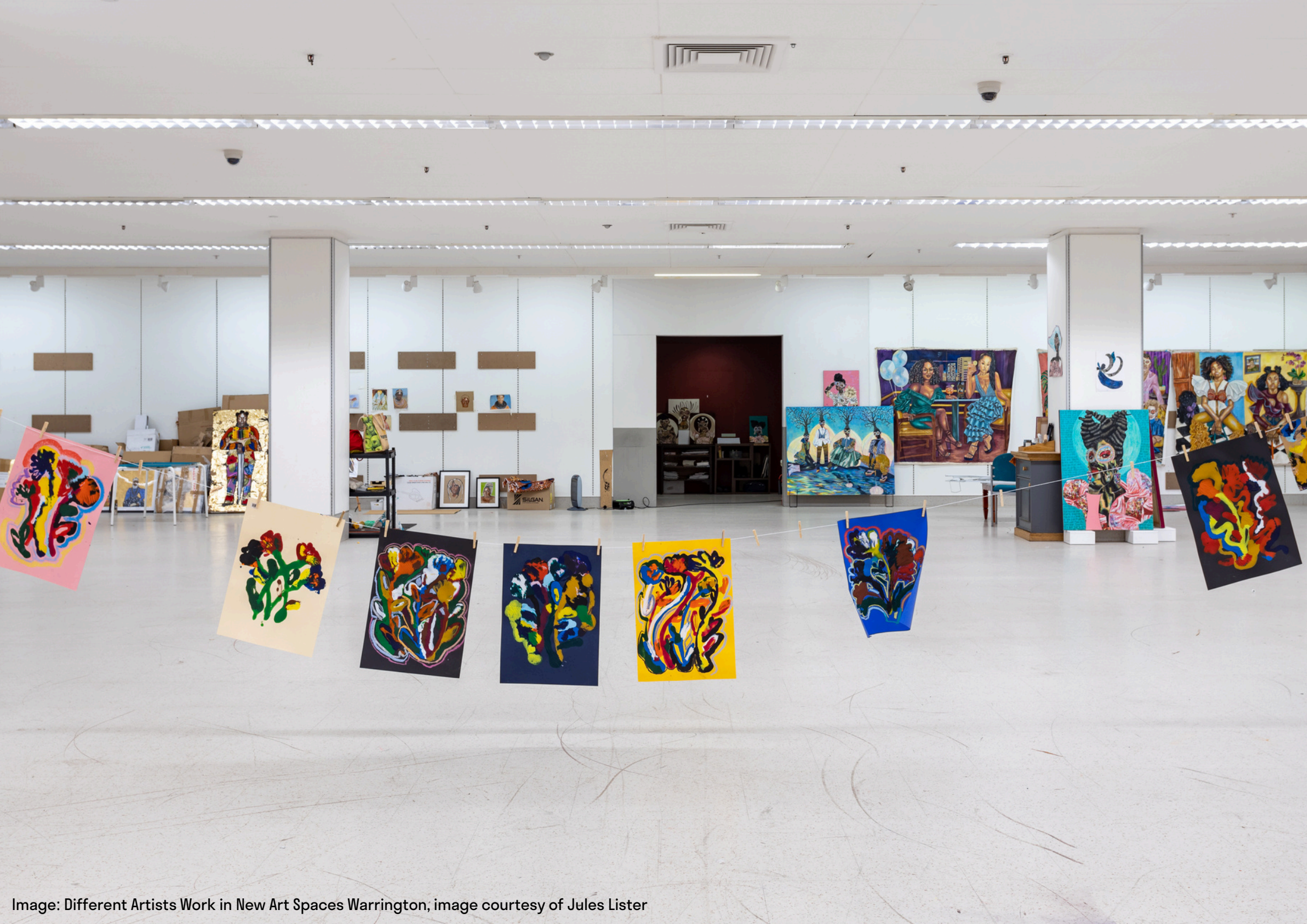
Image: Different Artists Work in New Art Spaces Warrington